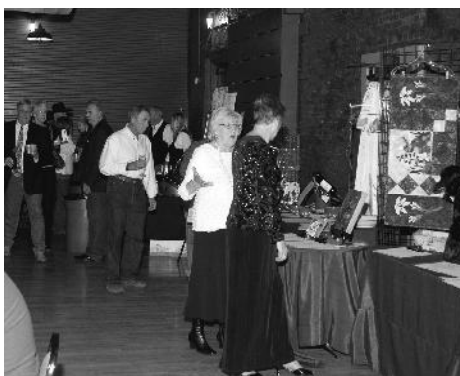
The guests thoroughly enjoyed the silent auction which boasted over 125 items! The auction netted the RHS $8,400!