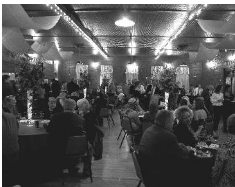
The Billings Depot ended up being a fabulous venue for our event this year. So elegant and nostalgic! Over 263 attendees hopefully had a fantastic time.