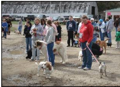
Rimrock Rover Ramble – May 1st Record year for the Rover Ramble! 145 participants and over $10,000 was raised for the spay/neuter program!