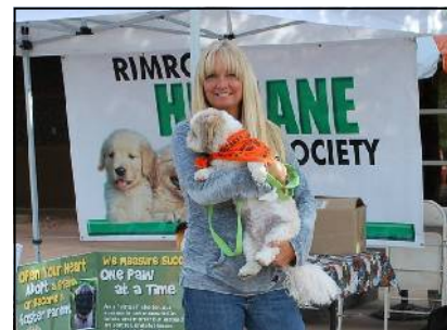
Harley Davidson Collars & Chrome—Aug 28th A great morning spent sharing our pets for adoption and watching the “hogs” come and go on their poker run to benefit the animals!