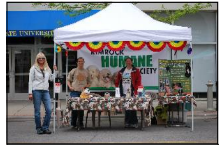
Petapalooza 2010—May 22nd First time event in downtown Billings ... although chilly it was a great to meet so many pet lovers in one place!