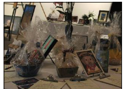
Wine & Whiskers—November 6th What an elegant and awesome event! See below article for all of the details and we will see you at Wine & Whiskers 2011!