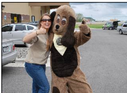
Slumberland Furniture Dog Days - June 12th A great time was had by all (can you tell?) at this event. Several of our animals for adoption found homes this day—YAY!