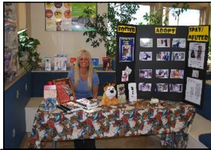
Shiloh Veterinary Open House—May 8th A great venue to not only share our pets for adoption but we raised over $400 in donations in less than two hours!