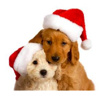
Check us out at: www.rimrockhumanesociety.org

NON-PROFIT ORG US Postage PAID Permit No. 88 Roundup, MT