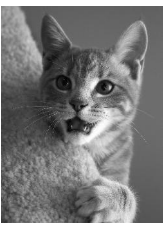
Claire was found as a stray kitten wandering down an alley. Picked up by a kind Samaritan and turned into the RHS program; she is now a beautiful 3 month old blue marble tabby with the letters GFC mysteriously spelled out on her side ... we believe that means "Great for Christmas" - (=