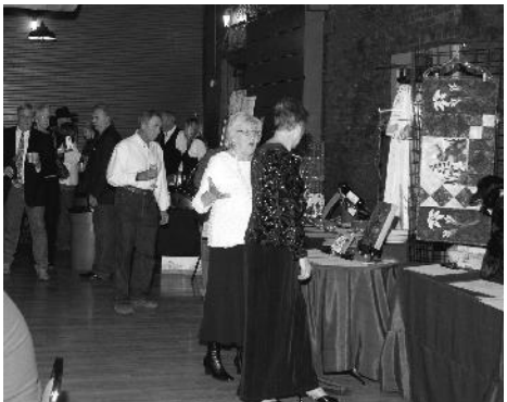
The guests thoroughly enjoyed the silent auction which boasted over 125 items! The auction netted the RHS $8,400!