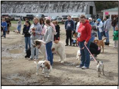
Rimrock Rover Ramble – May 1st Record year for the Rover Ramble! 145 participants and over $10,000 was raised for the spay/neuter program!