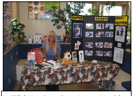
Shiloh Veterinary Open House—May 8th A great venue to not only share our pets for adoption but we raised over $400 in donations in less than two hours!