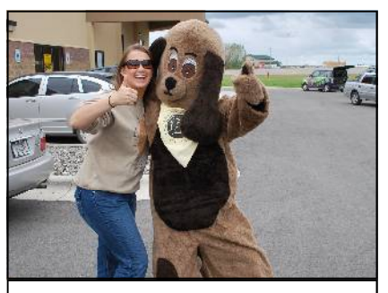
Slumberland Furniture Dog Days - June 12th A great time was had by all (can you tell?) at this event. Several of our animals for adoption found homes this day—YAY!