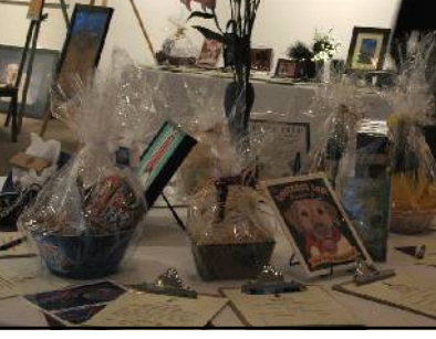
Wine & Whiskers—November 6th What an elegant and awesome event! See below article for all of the details and we will see you at Wine & Whiskers 2011!