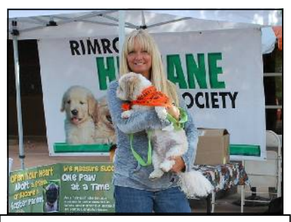
Harley Davidson Collars & Chrome—Aug 28th A great morning spent sharing our pets for adoption and watching the "hogs" come and go on their poker run to benefit the animals!