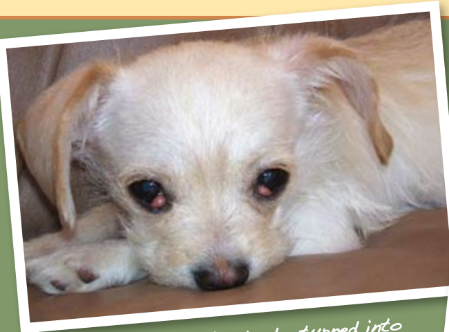
STUART LITTLE: Heartache turned into heart throb. Fostered and adopted.

Imagine saving a life simply by opening your heart and your home. This is the answer to a four-pawed prayer for the animals that come into the Rimrock Humane Society adoption program. Being a "virtual" shelter, all of our animals require a foster parent to keep them safe while we find them a forever home.